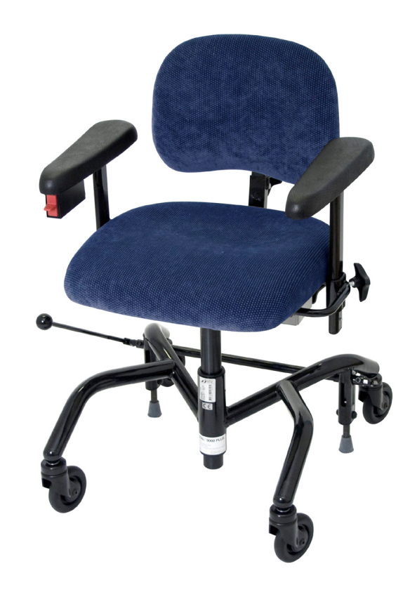
REAL 9000 PLUS