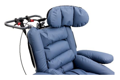
Left angled headrest.

The arm of the headrest consists of replaceable strong ball joints.