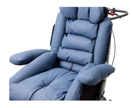
Padded skirt guards

There are an additional two slots in each skirt guard where the positioning harness can also be fitted.