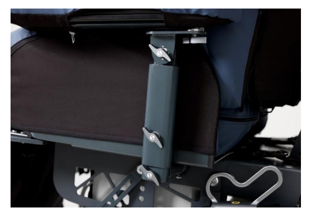
The bottom thumb screw allows the armrest to be removed.

Different kind of swing away functions for the different needs of the users.