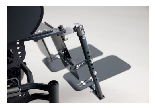
The legrests can be height-adjusted and angle-adjusted above the knee and ankle joints.

A Be aware that the user can fall out of the wheelchair if the armrest is not locked in position.