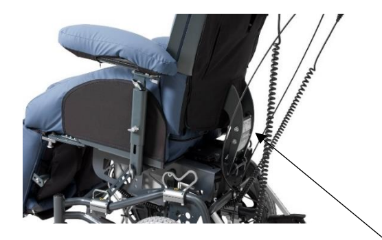
The design of the back system reduces the risk of shear of tissue when altering the angle.

Asymmetrical adjusting makes it easier to address anatomical challenges.