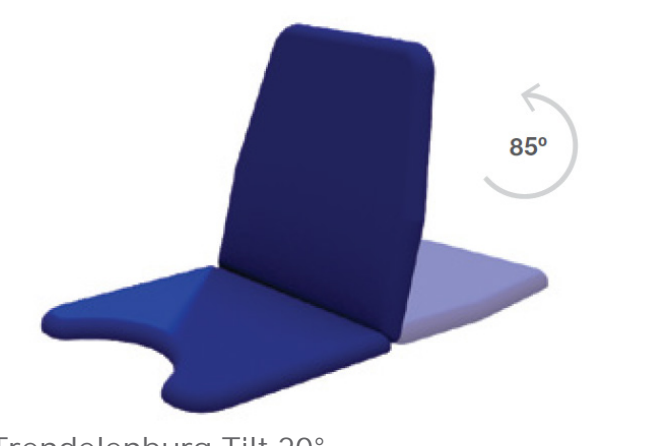
Trendelenburg Tilt 20°